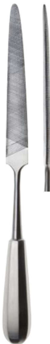
Knochenfeile KA.510.29 29,5cm