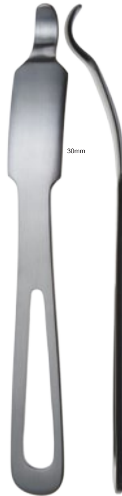
Lange-Hohmann KA.325.30 26,5cm