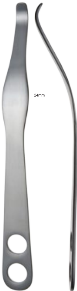
Hohmann KA.324.24 26,0cm