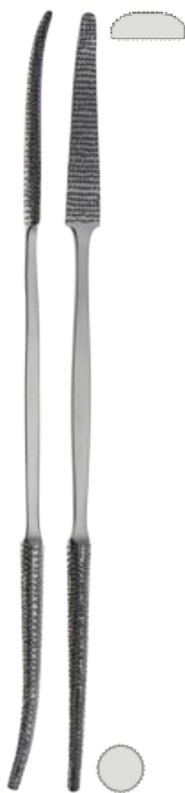
Putti KA.501.30 30,0cm