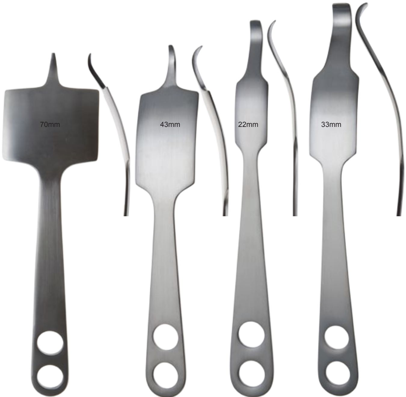
Hohman KA.320.70 24,0cm