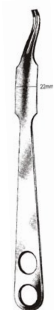
Lange-Hohmann KA.325.22 26,0cm