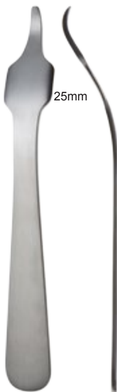
Verbrügge Like Simal