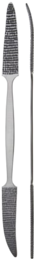
Putti KA.502.27 27,0cm