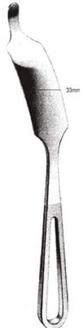
Lange-Hohmann KA.325.33 28,0cm