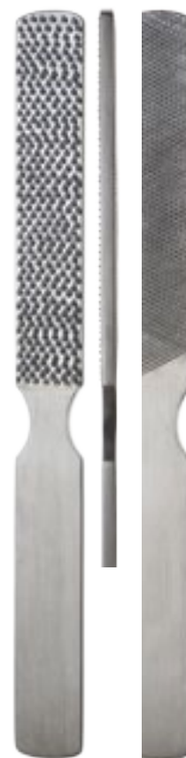
Knochenfeile KA.516.22 22,0cm